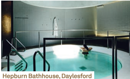
Hepburn Bathhouse, Daylesford