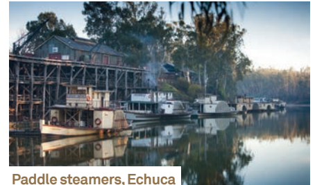
Paddle steamers, Echuca